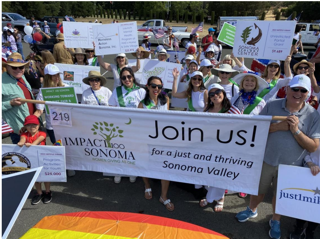
An enthusiastic group gathered for the morning start.

signs, and made a proud circuit around the Plaza to waves and cheers from the crowd lining the sidewalks.