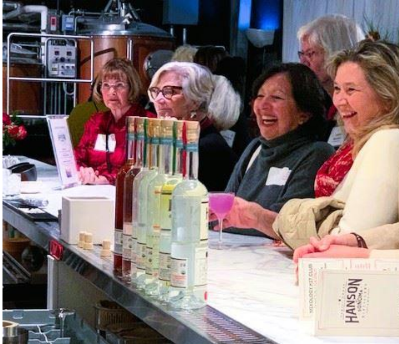
Party goers enjoying a Hanson libation.